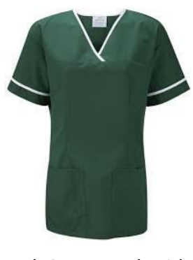
Dark Green scrub with white trim CSWs