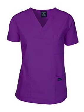
Purple scrub DREEAM / Research