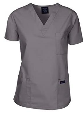
Dark Grey Charcoal scrub ACPs