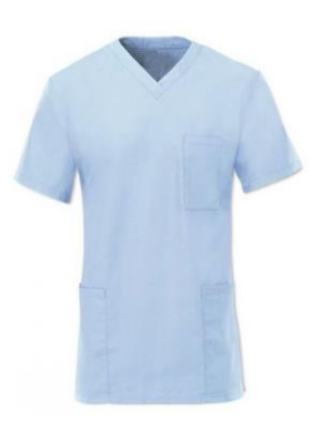
Light blue scrub ENPs