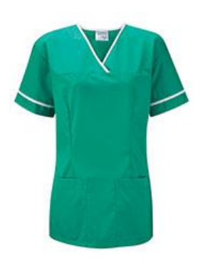
Light Green scrub with white trim EDAs