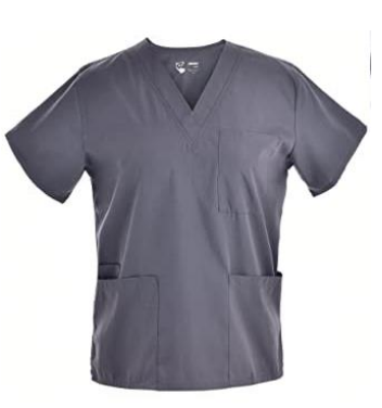
Light Grey scrub Doctors