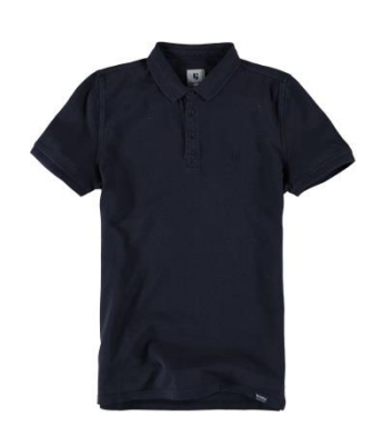
Blue Polo Top Play Specialist