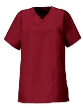
Burgundy Scrubs IDT