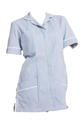
Blue and white striped top Physios