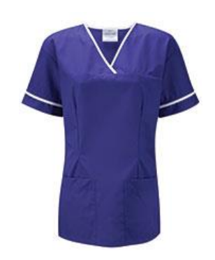
Royal blue scrub with white trim Band 6 Nurses