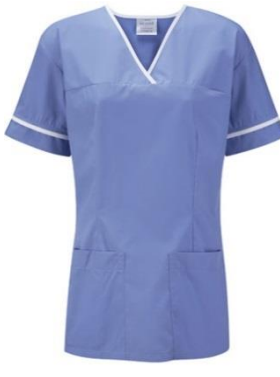
Light blue scrub with white trim Band 5 Nurses