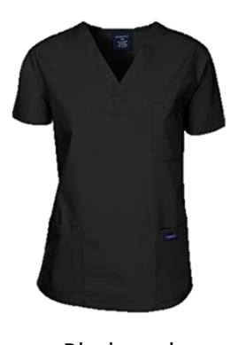
Black scrub Consultants