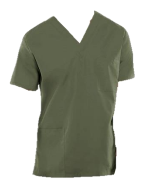
Dark Green (olive) scrub Registrars