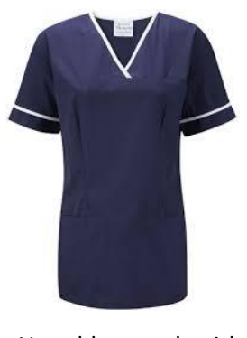
Navy blue scrub with white trim Band 7 Nurses