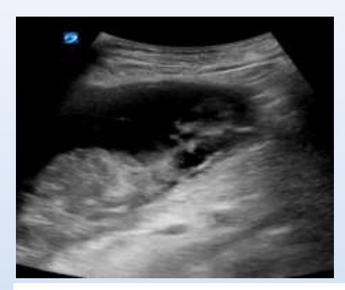
Grossly distended stomach with normal caliber aorta in the far field

Bedside abdominal USS showed normal caliber of aorta and incidentally a significantly distended stomach with lots of mobile and some fixed hyperechoic material. There was strong suspicion of gastric outlet obstruction. Patient had CT scan which diagnosed gastric outlet obstruction (GOO) with no ischemic gut or active blush of contrast. Later endoscopy confirmed a duodenal ulcer (DU) with a recent evidence of bleed as a cause of GOO and anemia.