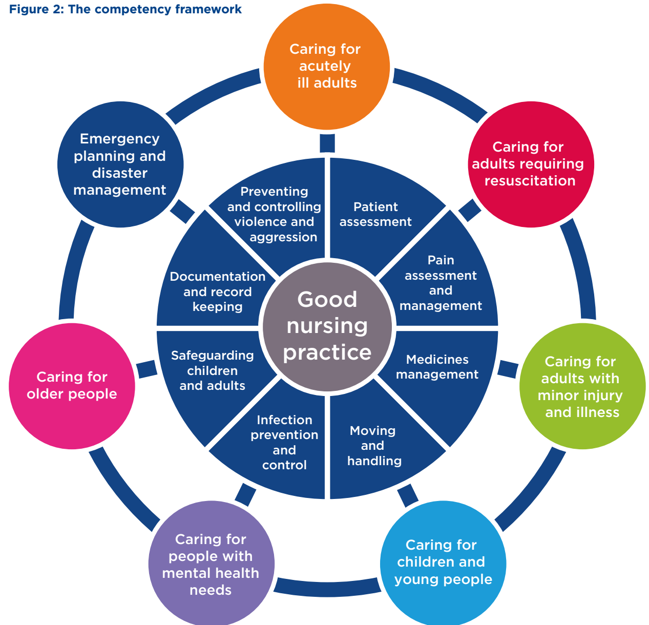
Figure 2: The competency framework

These sections appear in both Level 1 and Level 2 competency sets.