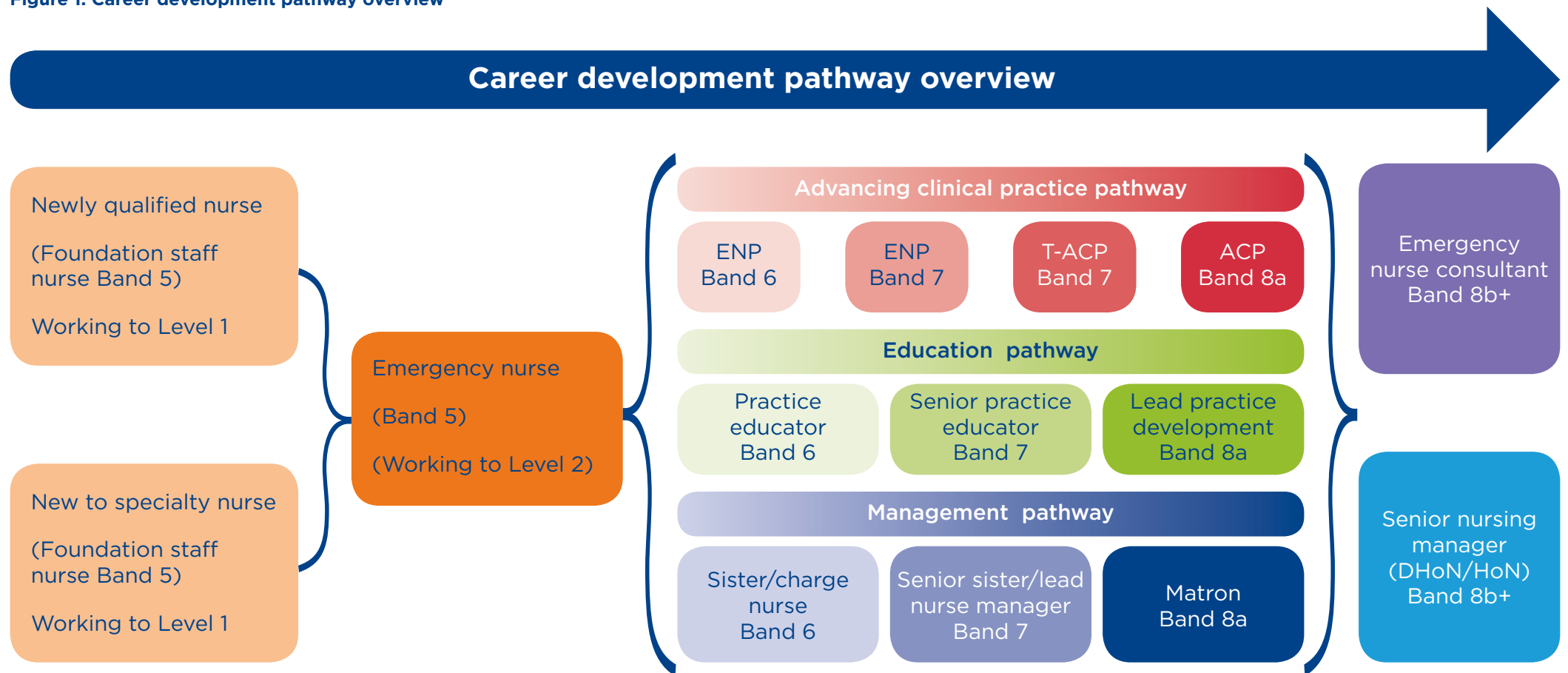
Figure 1: Career development pathway overview

Figure 1 maps the professional development pathways into management, education or clinical specialist roles for emergency nurses. Defining stages within the pathway not only facilitates career progression, but may also inform workforce development.